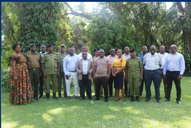
Members of the forum in a picture together

Members also discussed the safety challenges which stakeholders surrounding the entity could likely encounter when construction of the new factory gains momentum. Members agreed that collaboration of all stakeholders surrounding the estate would be crucial to mitigate those challenges.