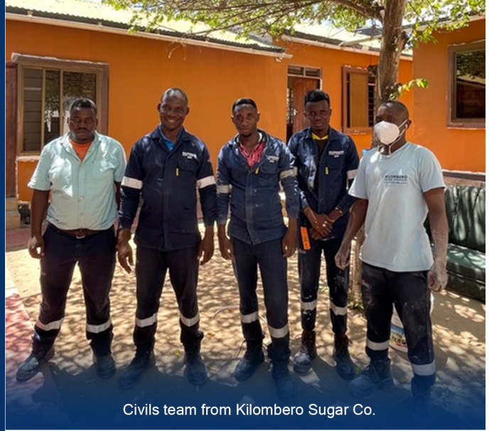
Civils team from Kilombero Sugar Co.

During a very rainy visit to the home in 2020 it was realised that the home itself was in desperate need of repairs and maintenance, with the roof leaking heavily, windows desperately needing maintenance and the whole house needing a coat of paint to lighten up the rooms and preserve the walls. Last year in November 2021, the amazing KSC maintenance team went to the Kidzcare orphanage with all the necessary material to repair and paint the home - 4 weeks later - the home had been transformed! On December 18th 2021, a small Christmas party was held to celebrate the new repaired home and provide each child with a new pillow and sheet. It was truly a special Christmas this year at Kidzcare!