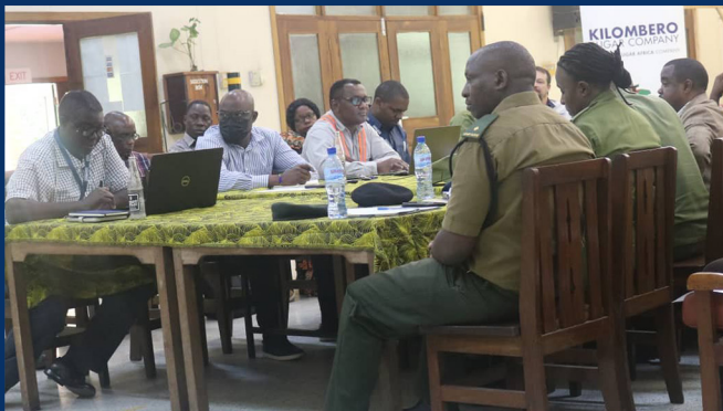
A cross-section of members in the meeting

On the 16th Dec 2021 the company held the Annual Safety Engagement with its stakeholders surrounding the Estate. The stakeholders included neighbouring entities, Ward Executives (who by virtue of their offices are chairpersons of the Safety and Security Committee) operating near the Estate and Police posts for Ruembe, KI and Kidatu.