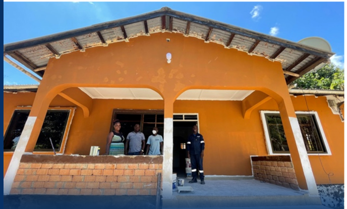
A cross section of the orphanage building being maintained