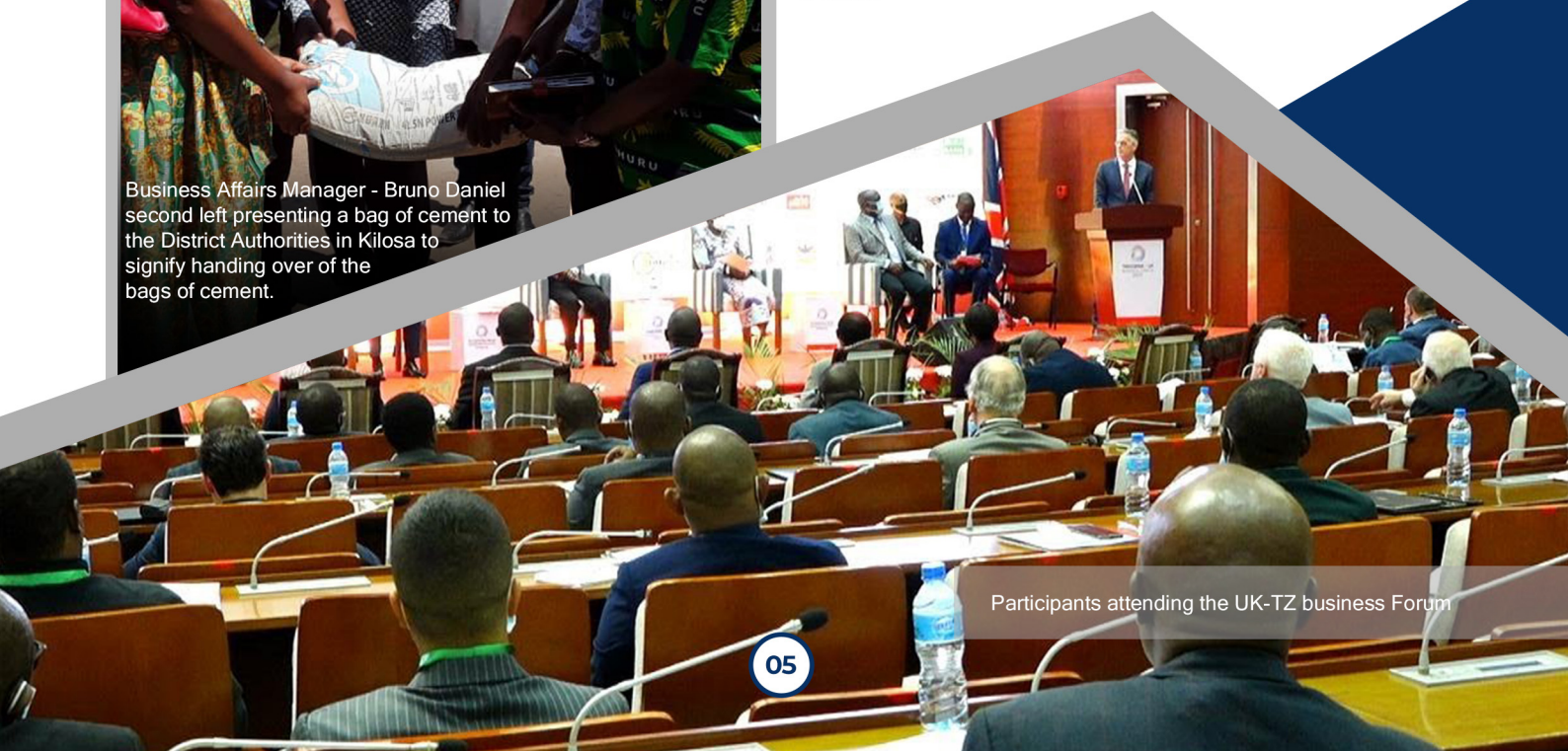
Participants attending the UK-TZ business Forum.

Being part of a UK Business, the Managing Director got an opportunity of sharing KSCL's experience with other business entities.